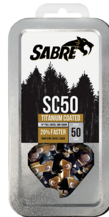
Part No. 099-1506