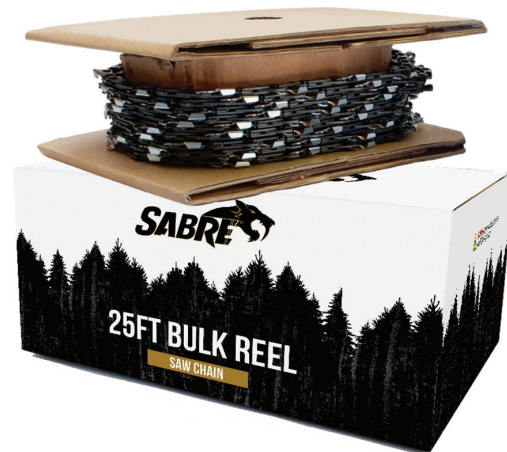
Part No. 092-6256